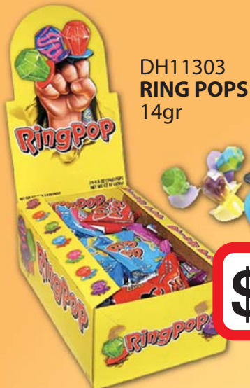
DH11303 RING POPS 14gr