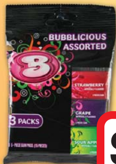
DH11925 BUBBLICIOUS 3 ASSORTED FLAVOURS GUM