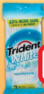
DH11927 TRIDENT WHITE 16PC DOUBLE SLEEVE WINTERFRESH 3PK