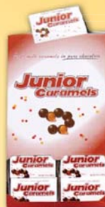
DH11344 JUNIOR CAMELS 113gr THEATRE BOX FLOOR DISPLAY