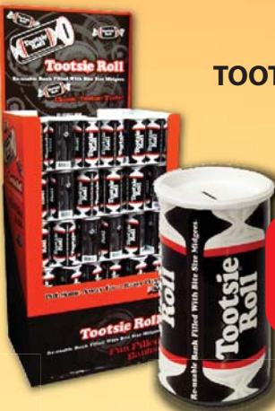
DH11347 TOOTSIE BANKS ORIGINAL FLOOR DISPLAY