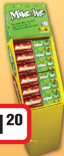
DH11346 MIKE & IKE & HOT TAMALES THEATRE BOX FLOOR DISPLAY 141gr