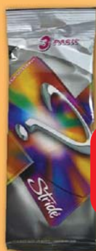
DH11926 STRIDE GUM MEGA MYSTERY 3PK