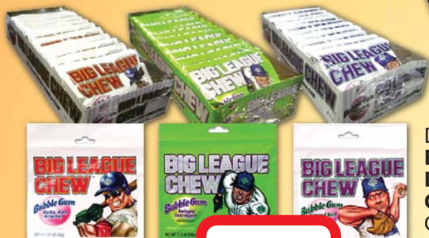
DH11340 BIG LEAGUE CHEW COMBO