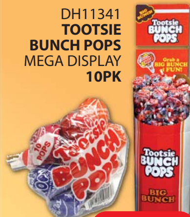
DH11341 TOOTSIE BUNCH POPS MEGA DISPLAY 10PK