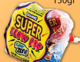
DH11342 CHARMS SUPER BLOW POP MEGA SIZE 4PK COUNTER DISPLAY 150gr