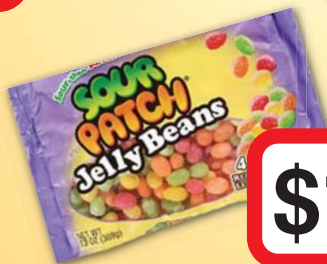
DH11382 SOUR PATCH JELLY BEANS 369gr